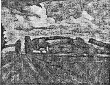
"Sun on the Hilltop" oil 24 x 30