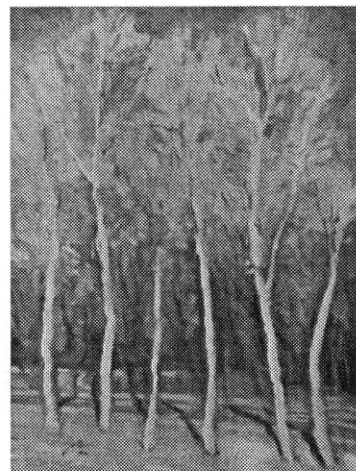
"Spring Sentinels" oil 16 x 12

"Pigments are the best teachers," he said. "I travel a lot and either take the paint box or camera with me, or both."