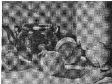
"Tea Kettle and Onions" oil 12 x 16